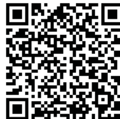
About QR Codes