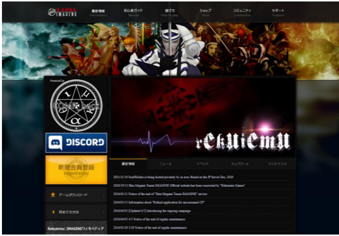
The Infringing Website

As shown below, the Infringing Website copies nearly every aspect of the Imagine Website: