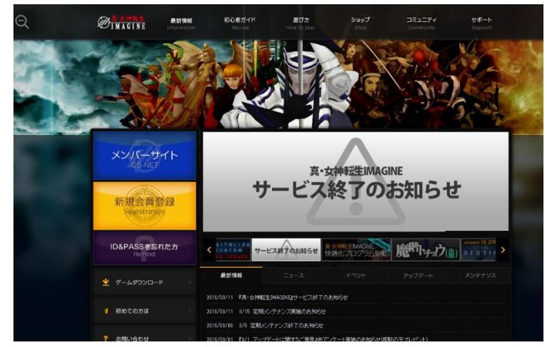
The Imagine Website

Attached hereto as Exhibit A is a true and correct screenshot of the Infringing Website home page (as visited on December 27, 2021).